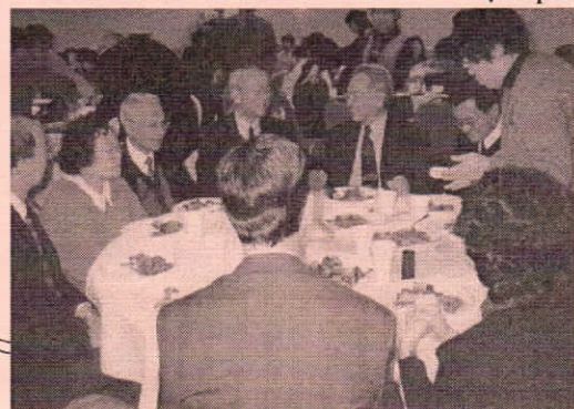
▼ Speakers at lunch

Each day begins with devotion and prayer. ▶