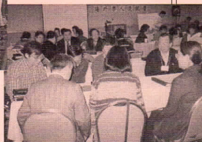
▲ Group Counseling