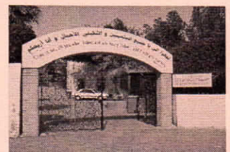
The National Evangelical Church of Kuwait, where our meetings held.