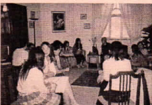
Chinese gathered for fellowship at a believer's home.

During their two-week mission trip in the Persian Gulf participants led over 100 Chinese to Christ. They also conducted three baptismal services in Dubai and Muscat with 18 brothers and sisters made public witness for Jesus among their fellow kinsmen.