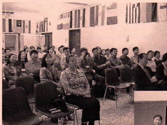
Evangelistic meeting in United Christian Church of Dubai.