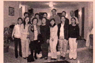
Brothers and sisters came to visit short-term mission team members.