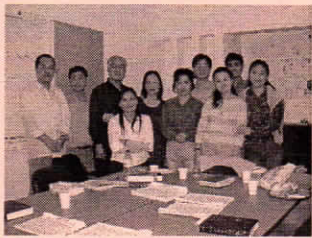
Short-term mission trip members with several brothers and sisters in Abu Dhabi.