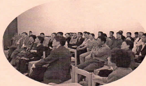
Evangelistic meeting in Sharjah.