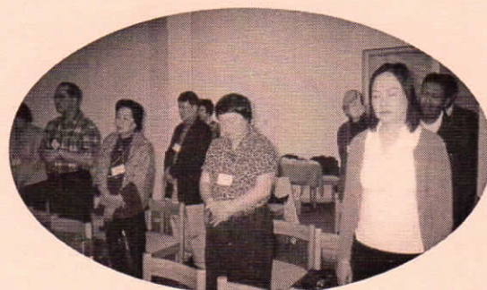
Participants prayed for the Chinese in Persian Gulf.

By God's grace the Conference was held on February 18 to 20 in Sharjah. United Arab Emirates (UAE), Sharjah is the third largest emirates, after Abu Dhabi and Dubai, situated about 30-minute drive north of Dubai. (The nickname of Dubai is the Middle East Hong Kong.) About 20 participants from Canada, Hong Kong, Japan, Malaysia, USA and local countries attended the Conference. Most of them were church pastors and elders, mission committee leaders, and seminary president and professor.