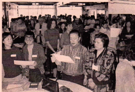
Friday worship service held at a Chinese restaurant.