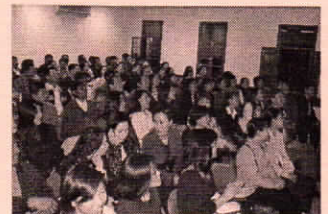
Congregation is eager to hear the gospel.