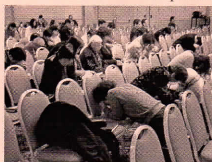
Each day began with prayer meeting and devotion.