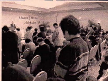
16 dedicated for full time missionary work.