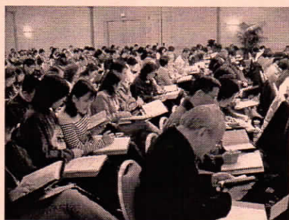
Over 350 Participants attended evening meetings.