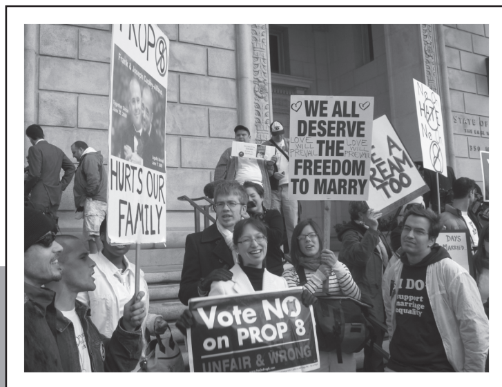
Opponents of Prop. 8.