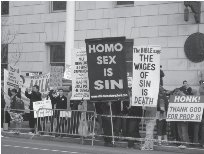
Christians held up signs as warnning to sexual sin.

Hundreds of supporters and opp cess on a big screen outside of th