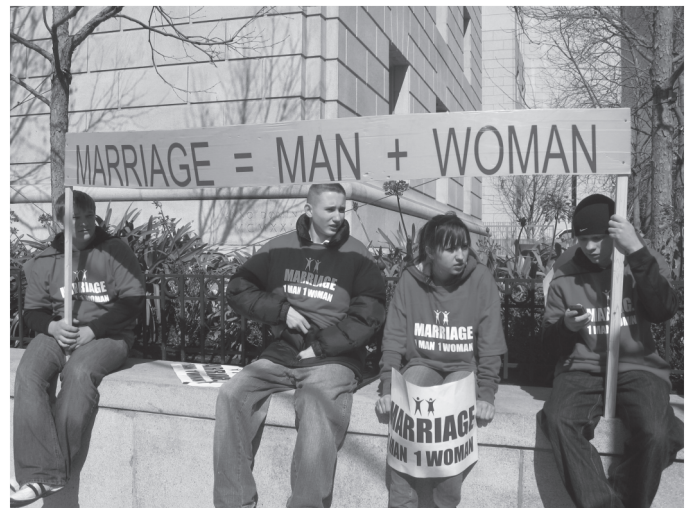
Youths speak up for traditional Marriage.

Opponents watched the hearing pro- the California Supreme Court.