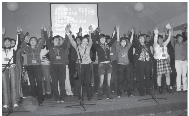
Lunar New Year Outreach in Dubai Chinese Christian Church.