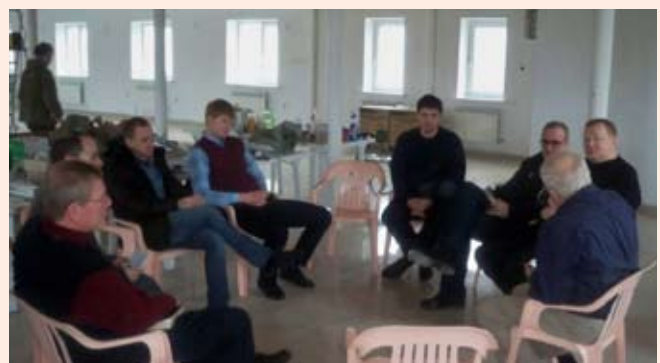
Men’s Saturday Morning Prayer Meeting