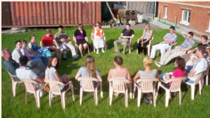
English Discussions Club Enjoying the Yard

At that same year, a fund was started for Christian Community Center. As fund grows, land was purchased in 2005, and construction started in 2008. The first level was completed in 2010 and occupied. Work began on the third level in 2011. We hope to complete phase 1 of the third floor by the end of June, 2012. This will include a sanctuary with a seating capacity of about 200 people. It will also provide much needed extra space for many of the current activities. In particular, we will have the capacity for accommodating many more children in our kids day camp program this coming summer.