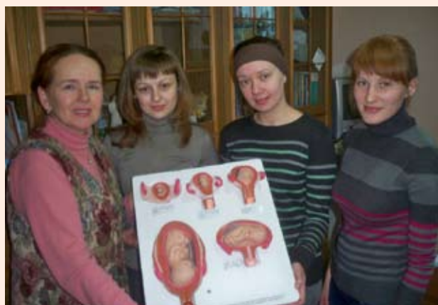
PRC Director with Young Volunteers

Work on the second floor of the building will begin when financial resources permit. This space will provide for an expanded library and more offices, classrooms and lavatories.