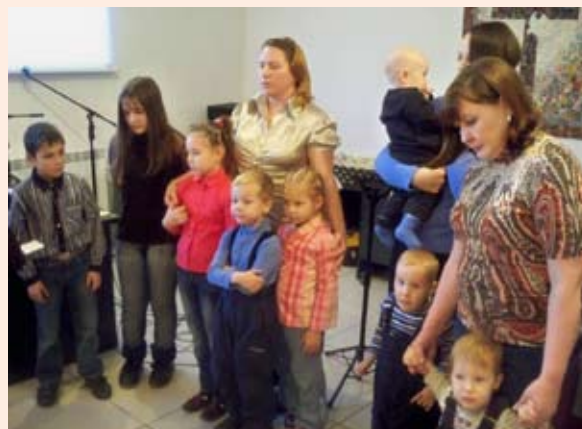
Praying for the Children at a Worship Service