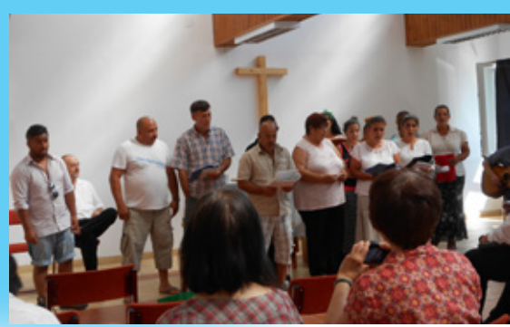
Roma Church Choir