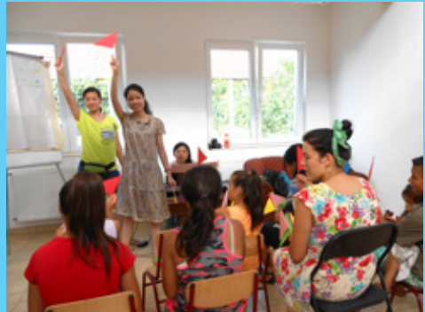
Childen English Camp